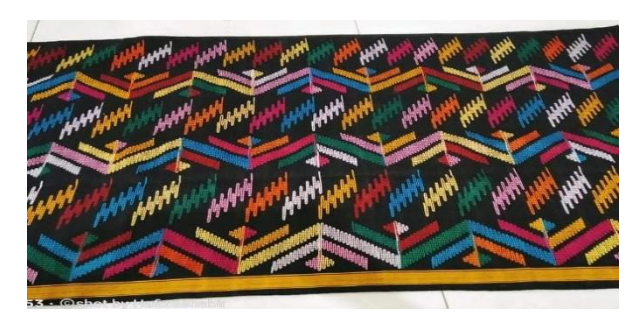
Figure 1: Colors of Tembe Nggoli Nggusu Upa Woven Fabric.