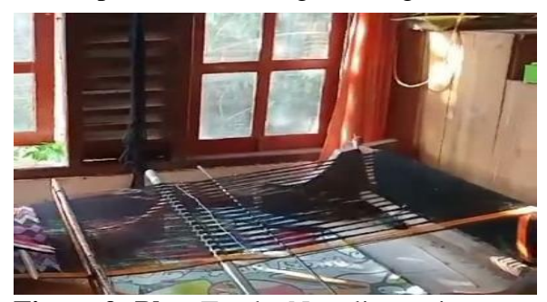
Figure 9: PlaceTembe Nggoli weaving