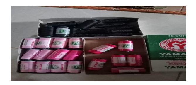
Figure 8: Nggoli thread

In general, the procedure for making Tembe Nggoli woven cloth goes through several stages, namely: