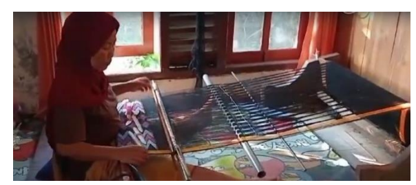
Figure 10: Weaving Process

The motifs and colors of West Nusa Tenggara's Tembe Nggoli woven fabric are traditional motifs such as lines. geometrics, flowers and plants. This motif is inseparable from the existence of customary rules that determine what shapes can be used as motifs on woven fabric, and also because of the strong influence of Islamic religious teachings which do not allow the use of living creatures as motifs. Meanwhile, the colors of Tembe Nggoli woven fabric consist of yellow, green, blue, pink, red, dark blue, light blue, black and white. These colors are used for the basic color of the fabric and the color of the motif.