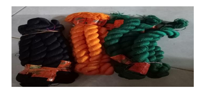
Picture6: Silami Yarn