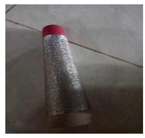
Figure 7: Gold and Silver Threads