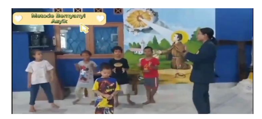
Figure CD.4 Children do a FUN Singing Model

Children's learning concentration increases significantly. Children are also more active in participating in learning activities and understand the concepts being taught more easily(Education, 2023). Starting from the initial activities such as prayer, opening greetings, apperception Rewards are FUN with words that show the children, especially for children at the Taman Fioretty Orphanage, that "I can, I am great, I am successful," is one of the concepts which is used in a learning approach that is interactive and fun for them and builds their self-motivated spirit.