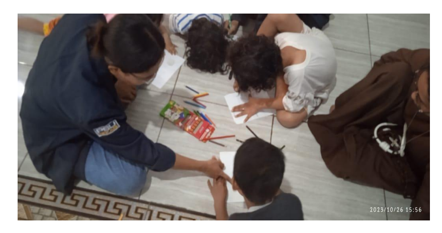
Figure 2. Children full of concentration in drawing (CD 2)

Based on observations from CD 1 findings below, the activities above reflect efforts to create a warm and respectful environment(Ghalda et al., 2023)in accepting teachers at the Taman Fioretty Orphanage. This activity also aims to build positive relationships between teachers and the Fioretty Park Orphanage environment as an expression of honor and friendliness. So it can provide a reflection to young children by teaching polite values.