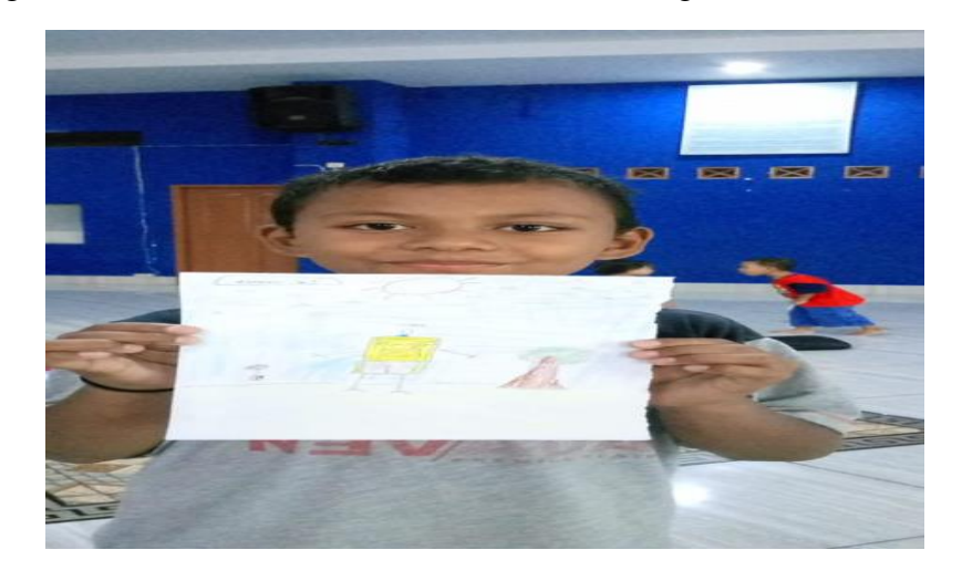
Figure 3. Results of children's drawing work in children's learning concentration (CD 3)