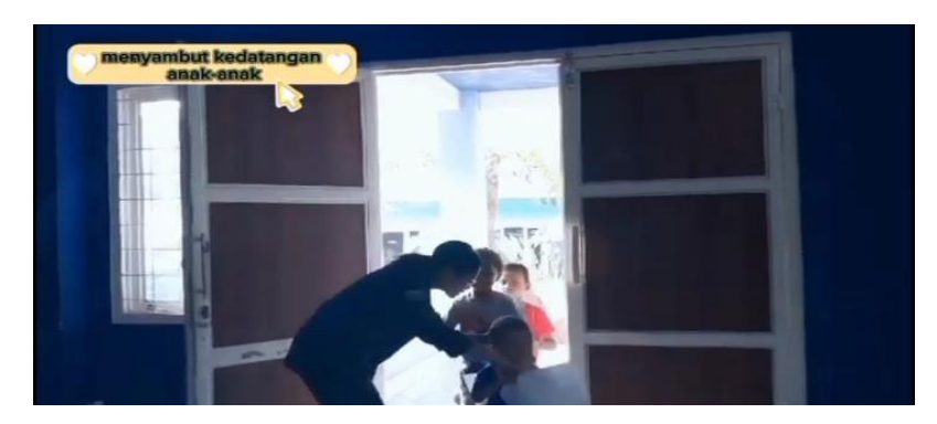
Figure.1 Expressions of honor and friendliness at Taman Fioretty Orphanage Kindergarten (CD 1)

Based on observations from CD 1 findings below, the activities above reflect efforts to create a warm and respectful environment(Ghalda et al., 2023)in accepting teachers at the Taman Fioretty Orphanage. This activity also aims to build positive relationships between teachers and the Fioretty Park Orphanage environment as an expression of honor and friendliness. So it can provide a reflection to young children by teaching polite values.