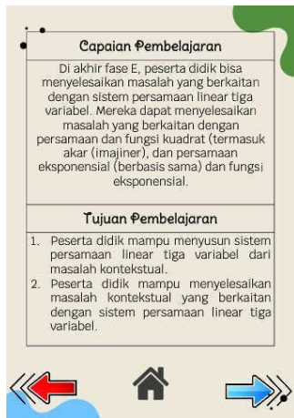
Figure 3. CP and TP