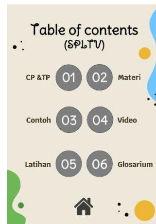
Figure 2. Table of Content

Pages 3-4 contain Learning Achievements (CP) & Learning Objectives (TP). Pages 5-18 contain material , which consists of apperception, the meaning of SPLTV, the general form of SPLTV, and the method for solving SPLTV, which can be seen in Figure 3-4.