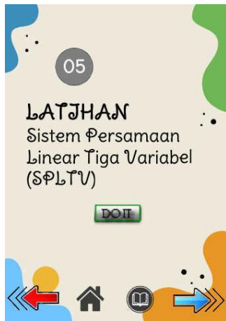
Figure 7. SPLTV training