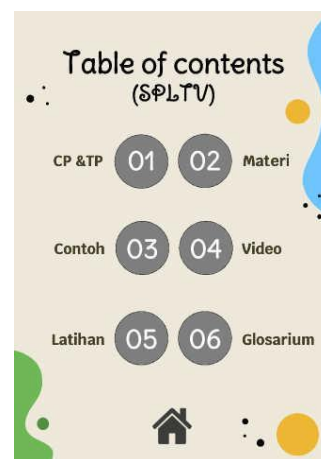
Figure 2. Table of Content

Pages 3-4 contain Learning Achievements (CP) & Learning Objectives (TP). Pages 5-18 contain material, which consists of apperception, the meaning of SPLTV, the general form of SPLTV, and the method for solving SPLTV, which can be seen in Figure 3-4.