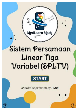
Figure 1. Main page

Page 1 contains the START button to start MedLearn Math, the question mark button (?) as a user guide, and the exclamation mark button (!) as a Short Profile and audio is provided to increase students' interest in starting learning. Page 2 contains a Table of Contents with 6 buttons, namely Learning Outcomes (CP) & Learning Objectives (TP), materials, examples, videos, exercises and glossary. It can be seen in image 1 and image 2 below.