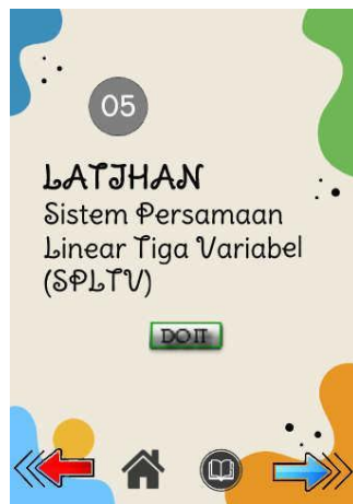
Figure 7. SPLTV training