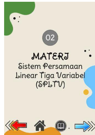
Figure 4. Material

Pages 19-38 contain examples, which consist of 3 examples, each of which uses a different solution method, namely the substitution, elimination and combined solution methods (substitution & elimination). Pages 19-38 contain examples, which consist of 3 examples, each of which uses a different solution method, namely substitution, elimination and combined solution methods (substitution & elimination) which can be seen in Figure 4 and Figure 5.