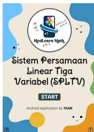
Figure 1. Main page

Page 1 contains the START button to start MedLearn Math, the question mark button (?) as a user guide, and the exclamation mark button (!) as a Short Profile and audio is provided to increase students' interest in starting learning. Page 2 contains a Table of Contents with 6 buttons, namely Learning Outcomes (CP) & Learning Objectives (TP), materials, examples, videos, exercises and glossary. It can be seen in image 1 and image 2 below.