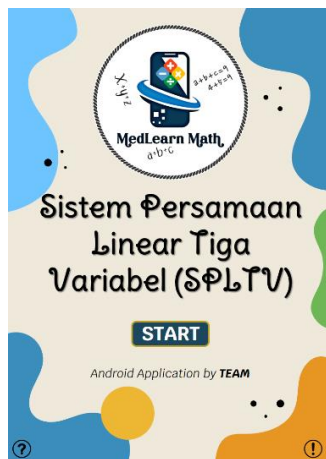
Figure 1. Main page

Page 1 contains the START button to start MedLearn Math, the question mark button (?) as a user guide, and the exclamation mark button (!) as a Short Profile and audio is provided to increase students' interest in starting learning. Page 2 contains a Table of Contents with 6 buttons, namely Learning Outcomes (CP) & Learning Objectives (TP), materials, examples, videos, exercises and glossary. It can be seen in image 1 and image 2 below.