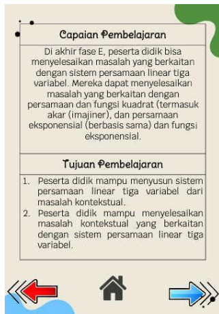
Figure 3. CP and TP