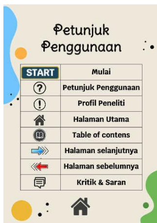
Figure 9. Instructions for Use

Page 46 is the user instructions page where the button has been placed on the main page in the form of a ask button and there is only a home button. Page 47 contains the last page, namely the Research Team page, the button has been placed on the main page in the form of an info button and on this last page there is a home button and a criticism and suggestion button, if you click it you will go directly to the Google form to fill in criticism and suggestions for MedLearn Math. used These two pages can be seen in figure 9 and figure 10 below.