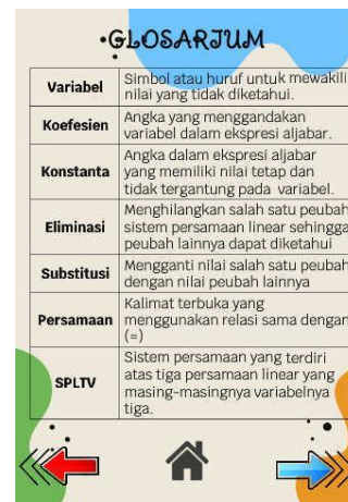
Figure 8. Glossary

Page 46 is the user instructions page where the button has been placed on the main page in the form of an ask button and there is only a home button. Page 47 contains the last page, namely the Research Team page, the button has been placed on the main page in the form of an info button and on this last page there is a home button and a criticism and suggestion button, if you click it you will go directly to the Google form to fill in criticism and suggestions for MedLearn Math. used These two pages can be seen in figure 9 and figure 10 below.