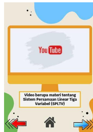
Figure 6. Video

Pages 41-42 contain exercises by using the DO IT button to start taking the test. By adding the DO IT button, if you click it, you will immediately see a Google form containing practice questions and there are buttons for the previous page, home, table of content and next page. in figure 7. Pages 43-45 contain a glossary, which is a collection of lists of important words or terms about Systems of Linear Equations with Three Variables arranged alphabetically. On this page there are also buttons for the previous page, home and next page, which can be seen in figure 8.