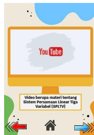
Figure 6. Video

Pages 41-42 contain exercises by using the DO IT button to start taking the test. By adding the DO IT button, if you click it, you will immediately see a Google form containing practice questions and there are buttons for the previous page, home, table of content and next page. in figure 7. Pages 43-45 contain a glossary, which is a collection of lists of important words or terms about Systems of Linear Equations with Three Variables arranged alphabetically. On this page there are also buttons for the previous page, home and next page, which can be seen in figure 8.