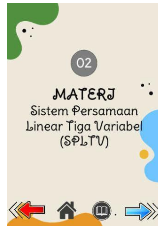
Figure 4. Material

Pages 19-38 contain examples, which consist of 3 examples, each of which uses a different solution method, namely the substitution, elimination and combined solution methods (substitution & elimination). Pages 19-38 contain examples, which consist of 3 examples, each of which uses a different solution method, namely substitution, elimination and combined solution methods (substitution & elimination) which can be seen in Figure 4 and Figure 5.