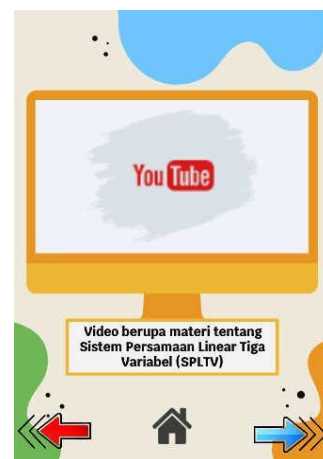
Figure 6. Video

Pages 41-42 contain exercises by using the DO IT button to start taking the test. By adding the DO IT button, if you click it, you will immediately see a Google form containing practice questions and there are buttons for the previous page, home, table of content and next page. in figure 7. Pages 43-45 contain a glossary, which is a collection of lists of important words or terms about Systems of Linear Equations with Three Variables arranged alphabetically. On this page there are also buttons for the previous page, home and next page, which can be seen in figure 8.