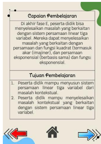
Figure 3. CP and TP