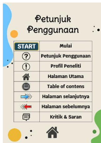
Figure 9. Instructions for Use

Page 46 is the user instructions page where the button has been placed on the main page in the form of an ask button and there is only a home button. Page 47 contains the last page, namely the Research Team page, the button has been placed on the main page in the form of an info button and on this last page there is a home button and a criticism and suggestion button, if you click it you will go directly to the Google form to fill in criticism and suggestions for MedLearn Math. used These two pages can be seen in figure 9 and figure 10 below.