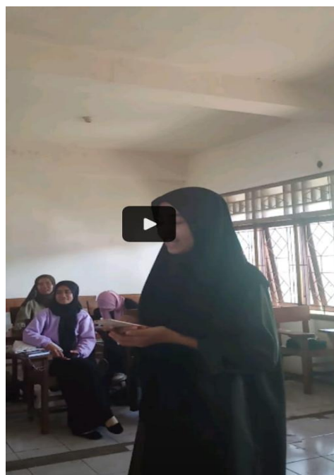
Picture 4. Debating skill

In picture 2, a male student is presenting his writing entitled “STISIP Mbojo Bima” and in picture 3, a female student is having an opening debate. In the debate class, students are divided into several groups and each group must support each other to be better. The difficulties they face