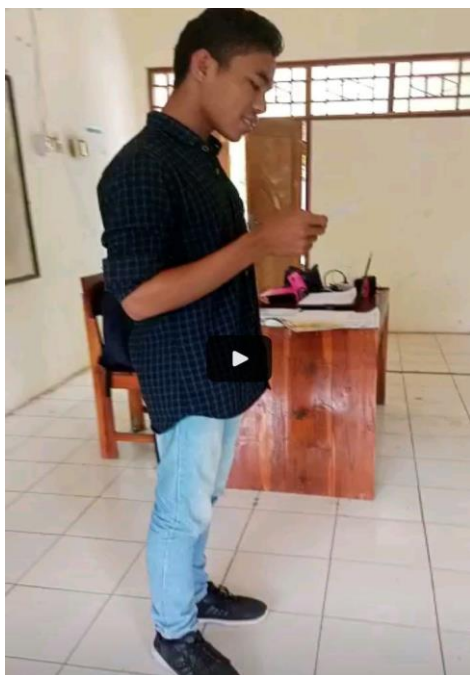
Picture 3. Talking about campus