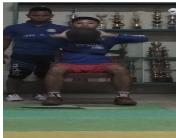
Figure 1. Arm Muscle Power Test (Personal Documentation)

The data collection technique in this research uses a practical test method obtained from secondary data and document studies with the implementation of data collection utilizing secondary data through measurement tests. The data collection technique used in this research requires the sample to carry out tests and re-tests. This research carries out a normality test, the aim of which is to ascertain whether the data obtained is symmetrical or normally distributed, that is, the distribution of numbers is mostly in the middle, and the further to the right/left, the distribution of numbers becomes smaller, so it resembles a bell