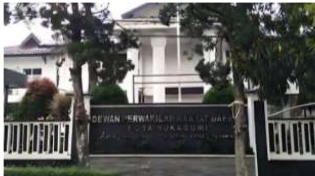
Figure 2. Sukabumi City DPRD Building

In the organizational structure of the DPRD Secretariat, the Public Relations (Humas) Sub-Division has a strategic role in supporting the implementation of institutional tasks, especially in the aspect of public communication. Public Relations is responsible for conveying information to the public, as well as establishing relations between the DPRD and the public. The position of Public Relations which is directly under the coordination of the DPRD Secretariat allows access to the institution's agenda and activities, and provides direct responsibility in terms of documentation, publication, and reporting of DPRD activities to the public.