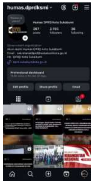
Figure 3. Instagram profile @humas.dprdksmi

Public Relations of the Sukabumi City DPRD Secretariat utilizes Instagram as a means of two-way communication between the DPRD and the public. This social media was chosen because it is able to convey information quickly, concisely, and easily accessible to the public. The information conveyed is generally in the form of documentation of DPRD activities in carrying out its duties and functions as a legislative institution. The delivery of information is packaged in the form of visual content, such as photos, videos, and short narratives (captions) that are designed to be easily understood by various groups. This strategy not only aims to disseminate information, but also encourage public participation, especially the younger generation, who increasingly rely on social media as their main source of information.