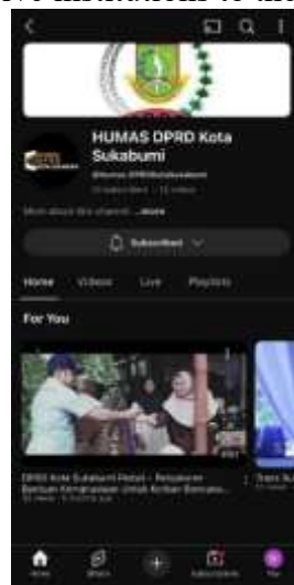
Figure 6. Channel of YouTube Public Relations of Sukabumi City DPRD

Platform YouTube is used to upload documentation of DPRD members' activities in long-form video format, such as plenary meetings, recesses, work visits, and implementation of legislative programs. YouTube is able to accommodate audiovisual content with a more flexible duration, allowing for the delivery of information more comprehensively and in-depth. Through platform This way, the public can access complete information about the DPRD's work process and institutional activities. The use of YouTube aims to increase the transparency and accountability of legislative institutions to the public.