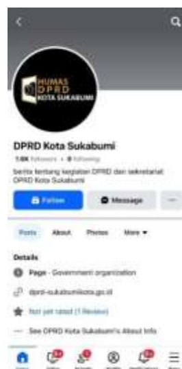
Figure 5. Facebook profile of Sukabumi City DPRD Public Relations

Sukabumi City DPRD Facebook also experienced a significant increase in activity. This happened after the Public Relations team linked the Instagram account