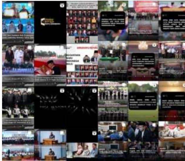
Figure 4. Post Before and After Update

team to improve visual quality and strengthen the DPRD's professional image on social media.