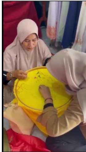
Image 1. Participants with disabilities engage in hands-on practice of Kapalo Panitik Embroidery with support from a facilitator throughout the training session.

The Sulaman Kapalo Panitik training program was conducted through sixteen sessions held in a phased and continuous manner. Each session was designed with different materials and practical exercises, ranging from an introduction to embroidery tools and materials, basic stitching techniques, practice with traditional motifs, color combinations, to independent practice in creating embroidery pieces. The activities were conducted in person so that participants could understand the embroidery-making process through hands-on experience.