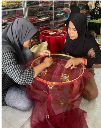
Image 4. Participants take part in a Kapalo Panitik embroidery workshop as part of efforts to preserve local culture and cultural literacy

In addition to serving as a medium for cultural education, this activity also serves as a means of cultural transmission to community groups that have historically had limited access to cultural activities. The involvement of people with disabilities in the practice of Sulaman Nareh demonstrates that cultural preservation can be carried out inclusively by involving all segments of society. The process of cultural transmission occurs not only through families or traditional cultural communities but also through community training and empowerment activities. [16] explain that participatory community-based activities can strengthen social engagement and the sustainable capacity development of vulnerable groups. Therefore, the Sulaman Nareh training program serves as both a form of cultural preservation and social empowerment for people with disabilities.