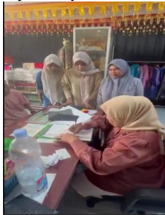
Image 5. Interaction between participants and facilitators during the Nareh Embroidery training session

In addition to increasing cultural participation, the training activities also strengthened social interaction among participants, facilitators, and the surrounding community. During the training process, participants not only learned embroidery techniques but also built communication, cooperation, and social relationships through group activities and joint discussions. The interactions formed during the activities helped participants feel more accepted and valued within their social environment. In this context, culture functions not only as a traditional heritage but also as a social medium capable of strengthening interpersonal relationships within the community. [18] states that culture has a social function as a means of forming social relationships, group identity, and community life.