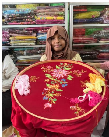
Image 2. Details of the design and the Kapalo Panitik embroidery created by the training participants

The embroidery motifs used in the training activities consist of floral motifs, arches, and combinations of traditional patterns commonly used in Nareh Embroidery. The selection of motifs was done gradually, starting from simple patterns to more complex ones, so that participants could adapt their technical skills throughout the learning process. In addition to introducing embroidery techniques, this activity also introduced the aesthetic values and local cultural identity embodied in Nareh Embroidery motifs as part of the culture of the Pariaman community. According to [13], intangible cultural heritage must be passed down through direct practice so that the cultural values it embodies can be understood and preserved sustainably.