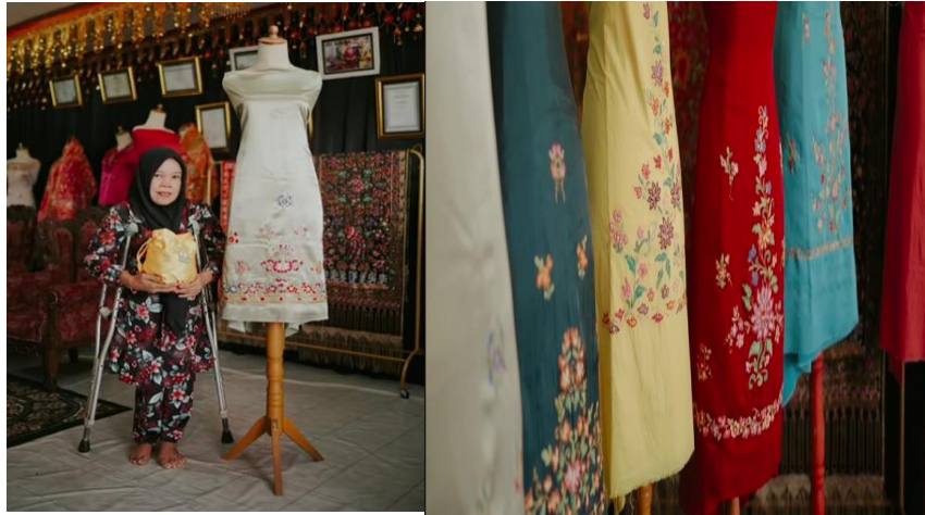
Image 3. Participants display their Kapalo Panitik embroidery works at the end of the training session

[16] explain that participatory community-based activities can strengthen social empowerment and increase the involvement of vulnerable groups in community activities.