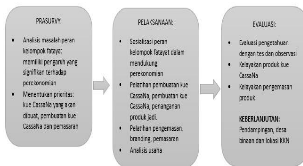
Picture 10 Flow of Community Service Activities

Interrupt Further Community Service activities that the service will carry out can be seen in the following picture: