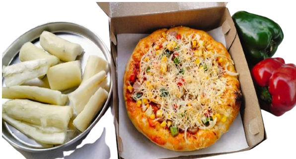
Picture 14 Pizza Cassava