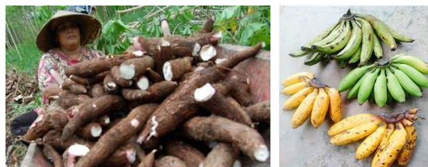
Picture 2 Basic ingredients Abundant Cassava and Banana (BY Editorial team, 2018)

There is an abundant harvest season in Tanjung Qencono Village, Kec. Way Bungur, the prices of cassava and bananas tend to be cheaper. In traditional markets in Tanjung Qencono Village, Way Bungur District, cassava and banana prices can be found at very affordable prices. From January to March, the price of cassava at Tanjung Qencono Way Bungur can range from IDR 1,000 to IDR 2,000 per kilogram, depending on the type and quality. (Purnama Media Group, 2023) Meanwhile, the price of bananas in these markets usually ranges from IDR 5,000 to IDR 8,000 per bunch, depending on the type and size.