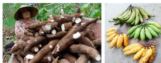
Picture 2 Basic ingredients Abundant Cassava and Banana

There is an abundant harvest season in Tanjung Qencono Village, Kec. Way Bungur, the prices of cassava and bananas tend to be cheaper. In traditional markets in Tanjung Qencono Village, Way Bungur District, cassava and banana prices can be found at very affordable prices. From January to March, the price of cassava at Tanjung Qencono Way Bungur can range from IDR 1,000 to IDR 2,000 per kilogram, depending on the type and quality.(Purnama Media Group, 2023)Meanwhile, the price of bananas in these markets usually ranges from IDR 5,000 to IDR 8,000 per bunch, depending on the type and size.