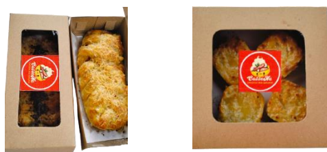
Picture 15 Bika Cassava