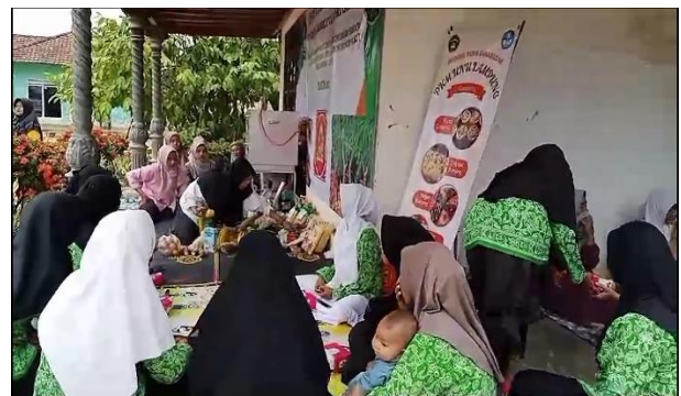
Picture 11 Socialization of CassaNa cake making