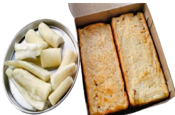
Picture 16 Banana Strudel

The results of training/demonstration activities are as follows: