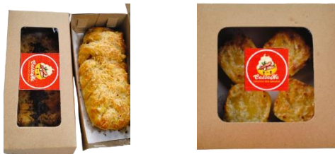
Picture 15 Bika Cassava