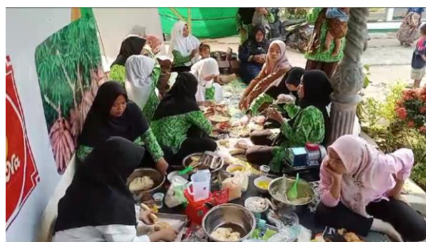
Picture 12 CassaNa cake making process