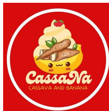
Picture 8 CassaNa logo