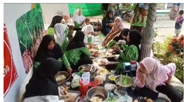
Picture 12 CassaNa cake making process