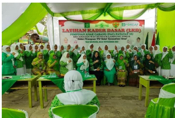
Picture 1 Tanjung Qencono Way Fatayat Group is confused