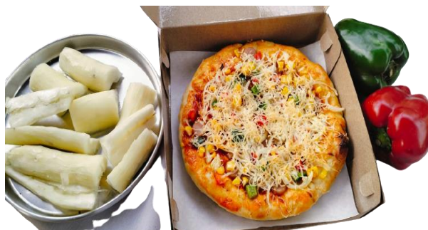
Picture 14 Pizza Cassava