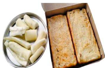
Picture 16 Banana Strudel

The results of training/demonstration activities are as follows: