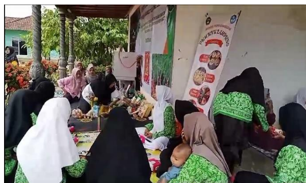
Picture 11 Socialization of CassaNa cake making