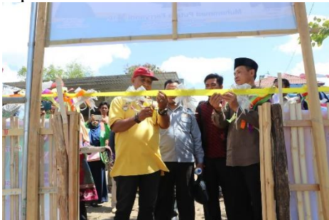
Figure 4. Official inauguration of the Mandala Literacy Park by the Regional Secretariat II of Bima Regency