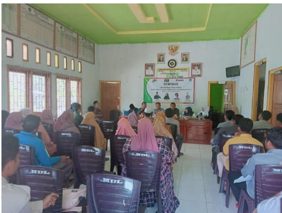
Figure 3. Implementation of Seminar Activities