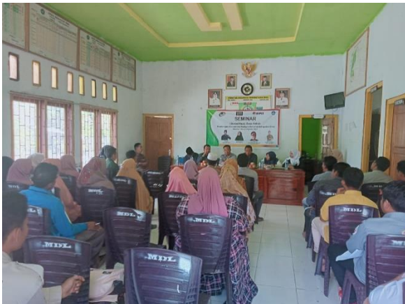
Figure 3. Implementation of Seminar Activities