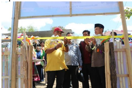
Figure 4. Official inauguration of the Mandala Literacy Park by the Regional Secretariat II of Bima Regency