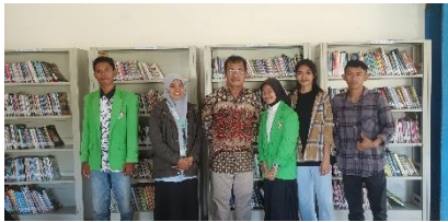
Figure 2 Socialization at the Bima district library