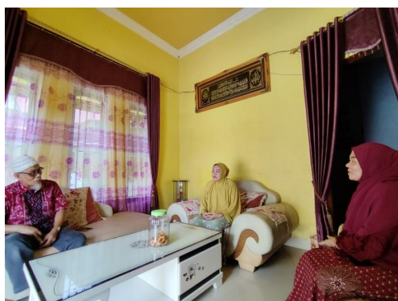
Picture2. Coordination with the Head of Wawatu Village, North Moramo District