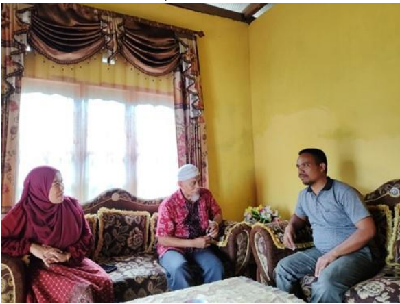
Picture1. Coordination with the Head of Tanjung Tiram Village, North Moramo District

and in Wawatu Village it was agreed on June 10 2023. The location for implementing the activities was the village hall of both villages in accordance with the directions of the two village heads. After that, the team made invitations to the Village Head, the target of the activity (pregnant women, toddler mothers, and posyandu cadres), the North Moramo sub-district, and the Lalowaru Community Health Center, North Moramo District.