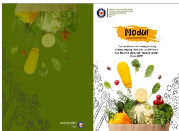
Picture4. Health Education Module

implementing a Clean and Healthy Lifestyle (PHBS) in the family. Apart from broadcast material, complete material can be read in the modules and pamphlets provided. These topics were chosen because the main causes of stunting are these factors, so the team aims to ensure that the activities carried out can provide good knowledge for pregnant women, mothers of toddlers and posyandu cadres in preventing stunting. After the material presentation session, the team provided the target with the opportunity to ask questions related to the material or outside the discussion related to toddler growth and development.