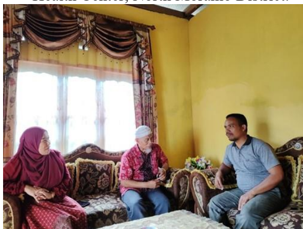
Picture1. Coordination with the Head of Tanjung Tiram Village, North Moramo District

and in Wawatu Village it was agreed on June 10 2023. The location for implementing the activities was the village hall of both villages in accordance with the directions of the two village heads. After that, the team made invitations to the Village Head, the target of the activity (pregnant women, toddler mothers, and posyandu cadres), the North Moramo sub-district, and the Lalowaru Community Health Center, North Moramo District.