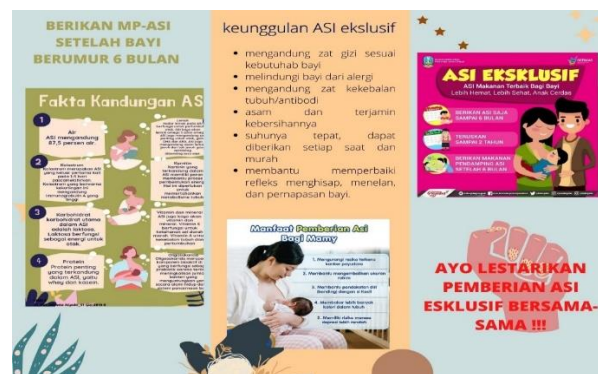
Picture5. Health Education Pamphlet

After the presentation of the material was given, the team then provided examples of measuring and monitoring the nutritional status of toddlers so that mothers of toddlers could detect early if their children were included in the stunting category. Apart from that, this training is also expected to improve the skills of posyandu cadres in terms of measuring the nutritional status of toddlers and if they find stunted toddlers, they can immediately work together with the Community Health Center team in handling stunted toddlers in their work area so that toddlers who fall into the stunting category can be handled quickly. .