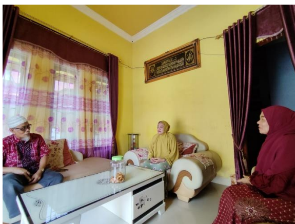
Picture2. Coordination with the Head of Wawatu Village, North Moramo District