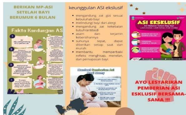
Picture5. Health Education Pamphlet

After the presentation of the material was given, the team then provided examples of measuring and monitoring the nutritional status of toddlers so that mothers of toddlers could detect early if their children were included in the stunting category. Apart from that, this training is also expected to improve the skills of posyandu cadres in terms of measuring the nutritional status of toddlers and if they find stunted toddlers, they can immediately work together with the Community Health Center team in handling stunted toddlers in their work area so that toddlers who fall into the stunting category can be handled quickly. .