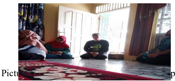
regarding Organic Plant Cultivation

socialization activities for the cultivation of organic food crops: