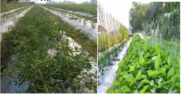
Figure 8. Organic Vegetables

The overall results of this evaluation show that organic crop cultivation not only provides better results in terms of agricultural productivity, but also contributes to environmental preservation and better public health. We believe that this practice is a step in the right direction towards more sustainable farming and healthier food for the future. The following are the results of documentation of organic plants that have grown well: