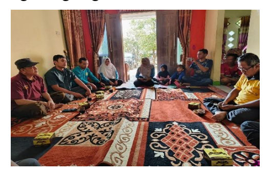
Picture. 3 Socialization with Farming Groups about Organic Plant Cultivation