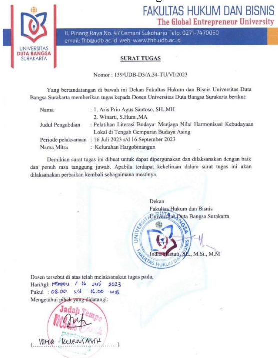
Figure 1 Letter of assignment