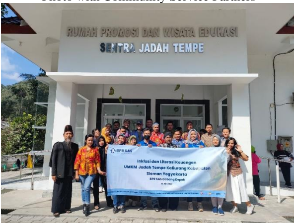
Photo with Community Service Partners