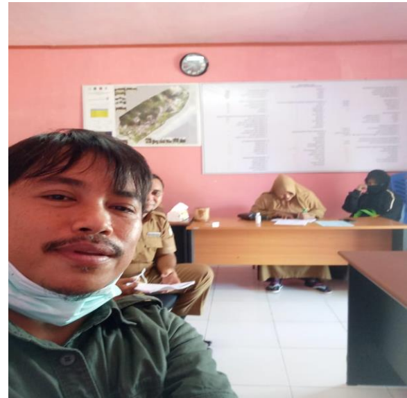
Coordination atmosphere with Kastela Village Head and Staff

because it will not cause disruption to daily tasks which are their main responsibilities.