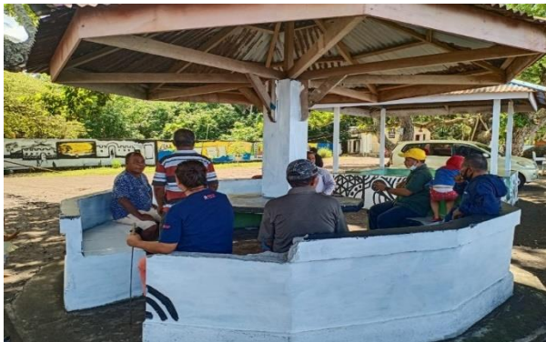
Documentation of 2023 PKm Implementation

According to research conducted by Mamoto, Mandey, and Benu (2021:164-168), several reasons for the increase in idle land are social and economic factors.