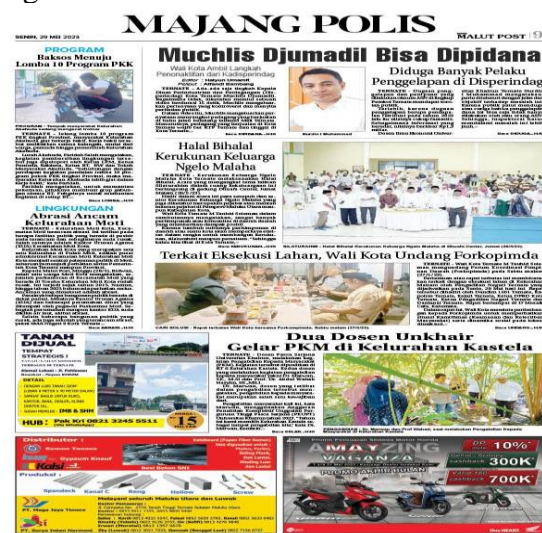
Publication of PKm activities in 2023

The participants were also shown the potential economic value of raising tilapia fish. That is, if the rearing process goes well, the 500 fish will be harvested in approximately 4 months or with an average size of around 250 – 200 grams, or around 4 – 5 fish per kilo. If the price of tilapia fish for consumption on the market is IDR 40,000,- then with 500 seeds and assuming they are successfully harvested, the amount of income earned by the community in 4 months is around 4,000,000,- - 5,000,000,-. If you subtract working capital of 2,500,000 to around 3,000,000, it means a net profit of around 1 to 1.5 million. Imagine if this business was taken seriously and in even larger volumes.