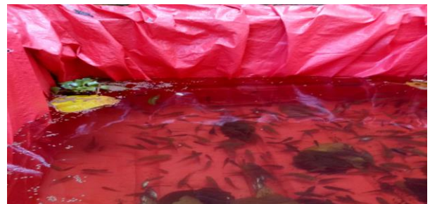
Condition of the Pond after Filling with Fish Seed

which has sufficient economic value. Starting from a demonstration of the pool and procedures for maintaining it. For this reason, there is a discussion about how to make a pond using tarpaulin media. Next, a discussion continued on how to keep tilapia fish and how to handle them.