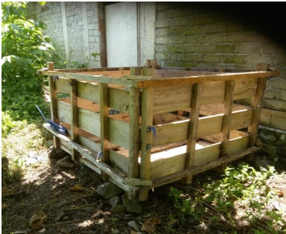
Container for placing tarpaulin