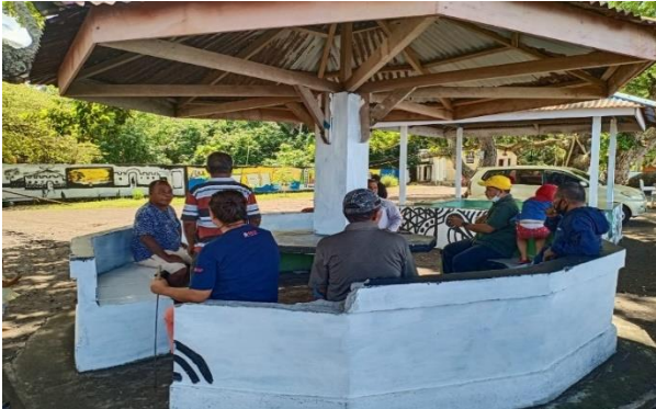
Documentation of 2023 PKm Implementation

According to research conducted by Mamoto, Mandey, and Benu (2021:164-168), several reasons for the increase in idle land are social and economic factors.