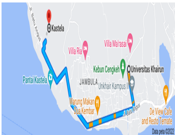
Activity Locations, Google map

Kastela Village is included in the geographical area of South Ternate City. Kastela Sub district has a sub-district area of 14.75 ha and has 4 RTs and 3 RWs. Kastela Sub-district is directly adjacent to the surrounding sub-districts: North side, Jambul sub-district, West side, Free Sea, East side, Foradiahi Sub district, South side, Rua sub-district. The population is 502 women. The total male population is 435 people. The population percentage is 937 people, and 239 heads of families (KK).