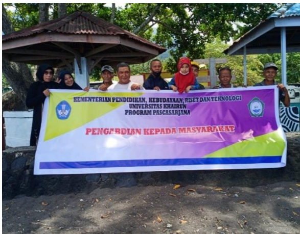
Documentation of 2023 PKm Implementation

From the discussions and observations of PKm program implementers, several reasons why the community is less motivated to cultivate the idle land are related to the rocky condition of the land, the local community's habit of releasing livestock which disturbs the crops, lack of skills, and limited capital. This is in line with the research results of Karim and Adelia (2018: 88), that the ability to cultivate land is greatly influenced by the experience and skills of farmers in overcoming crop failure. From the availability of labor, business capital is a determining factor in cultivating land.