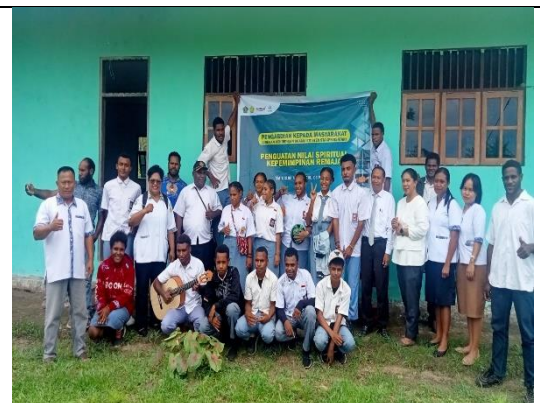
Foto. 1 kegiatan inti, ceramah diskusi di SMTK Gloria Sentani