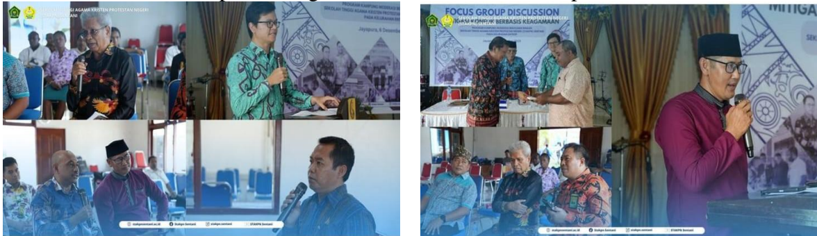
Figure 1. FGD activities

Concrete activities for implementing the FGD can be seen in the picture below: