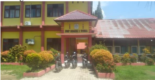
Figure 1. School Conditions

School Curriculum, schools have implemented the 2013 Curriculum and the Independent Learning Curriculum. Unfortunately, the independent curriculum implemented in grade VII lacks independence in learning, while the 2013 curriculum implemented in grades VIII and IX tends to emphasize knowledge, less improving student skills such as critical reading and creative writing.