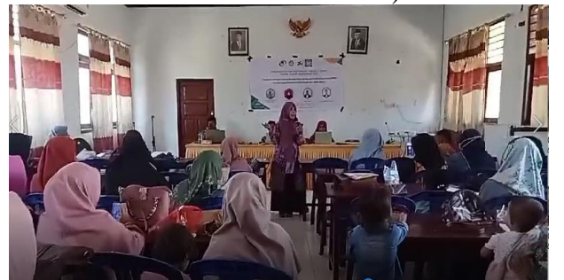
Figure 6. Implementation Stage (Simulation of Technology Implementation and Subject Teacher Innovation)