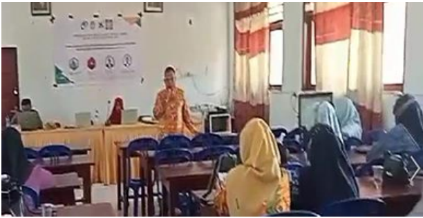
Figure 7. Implementation Stage (Simulation of Technology Implementation and Subject Teacher Innovation)

The third and fourth days are the stages of technology implementation. Each group is trained by instructors consisting of competent students and accompanied by lecturers. Each participant carries out a simulation of critical reading and creative writing literacy learning based on the RADEC Model and is trained until they are able and fluent in carrying out the learning process.