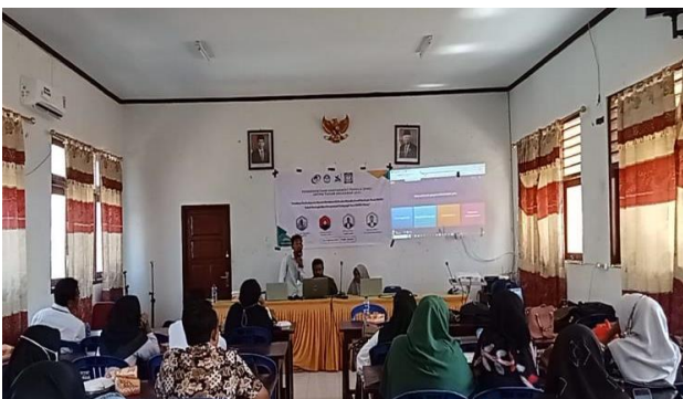
Figure 3. Delivery of Literacy Learning Media Material Through the Wardwall and Quizzes Digital Platforms