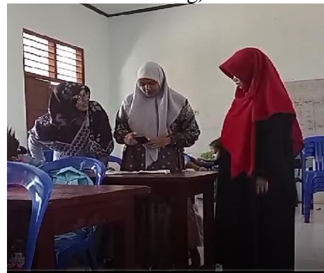
Figure 9. Evaluation and Mentoring Stage of Technology and Innovation Implementation