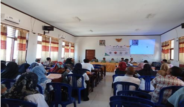
Figure 1. Socialization Stage of Training Activities

In this training activity, 90 teacher participants in SMPN 1 Woja were gathered who participated in critical reading and creative writing literacy learning training based on the RADEC Model. Before the training activity began, before of the training's day the participants filled out the pretest.