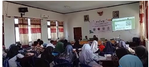
Figure 4. Delivery of Literacy Barcode Creation Material, access to the tiered text literacy platform and input of text types and literacy works in Barcode

The socialization stage was carried out on the first day, August 28, 2024, along with the delivery of training materials. On the second day, the training stage was again carried out, with materials delivered by 3 speakers, after which the training participants were asked to provide questions related to the material that was not yet understood. At the end of the training, the teachers participating in the training were divided into several groups according to their areas of expertise/subjects taught to conduct direct training on how to learn critical reading literacy and creative writing based on the RADEC Model.