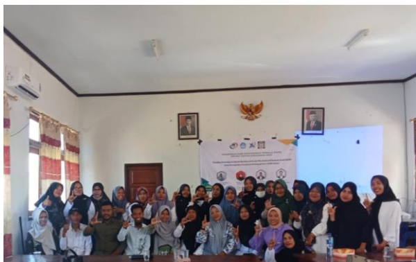
Figure 12. Group Photo at Training Activities