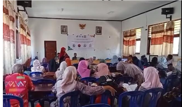
Figure 8. Implementation Stages (Evaluation of the implementation of Technology and Innovation carried out by Teachers after training)

test to determine the level of understanding and effectiveness of the training program.