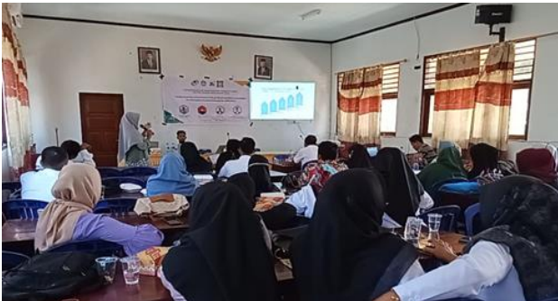
Figure 2. Training Stage (Delivery of Critical Reading Literacy and Creative Writing Learning Materials based on the RADEC Model)