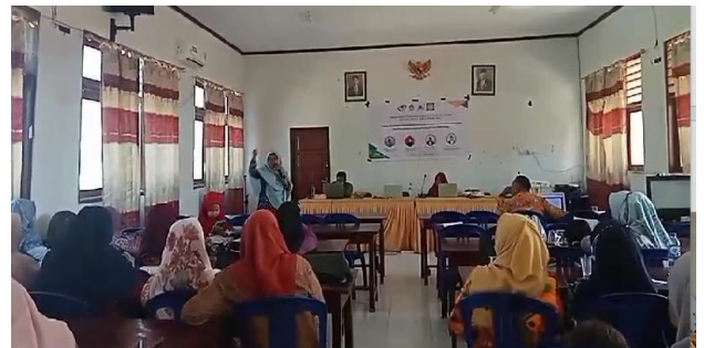
Figure 5. Implementation Stage (Simulation of Technology Implementation and Subject Teacher Innovation)

The socialization stage was carried out on the first day, August 28, 2024, along with the delivery of training materials. On the second day, the training stage was again carried out, with materials delivered by 3 speakers, after which the training participants were asked to provide questions related to the material that was not yet understood. At the end of the training, the teachers participating in the training were divided into several groups according to their areas of expertise/subjects taught to conduct direct training on how to learn critical reading literacy and creative writing based on the RADEC Model.